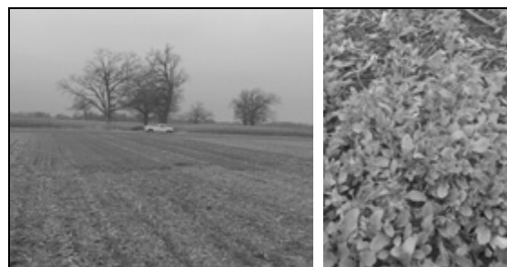
Photos taken 11/7/11 at the St. Joseph County SWCD's Cover Crop Test Plot. Cover crops can be a key ingredient for managing for soil health. For more on the SWCD's Cover Crop Test Plot and our upcoming Cover Crop Field Day on 4/4 @4, see pg. 3.