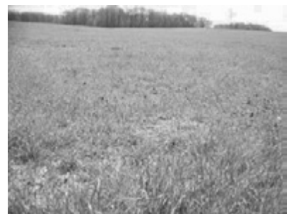
Field with Cover Crop

Or, visit our web page at: http://www.nrcs.usda.gov/wps/portal/nrcs/main/in/programs/