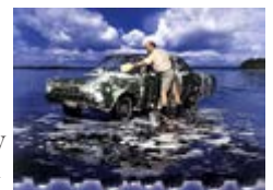
When you're washing your car in the driveway, remember you're not just washing your car in the driveway.

Have your vehicle serviced regularly to prevent problems that lead to leakage. Clean up any spilled brake fluid, oil, grease and antifreeze from garages, driveways and streets. Do not hose these fluids or any cleanup residue into the street. If you change your own oil, be careful to avoid spills and collect waste oil for recycling. Take your vehicle to a car wash to prevent soaps and waxes from being washed into the storm drain. Car washes send dirty water to the wastewater treatment plant. If you wash your vehicle at home, wash it on the lawn, not the driveway.