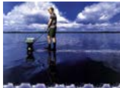
When you're fertilizing the lawn, remember you're not just fertilizing the lawn.

When we think of environmental pollution, we most often conjure up images of smoking factories, toxic waste dumps and oil spills. What we don't realize, however, is that the leading cause of water quality problems is from pollutants that don't originate from a single source or enter waterways at a particular site.