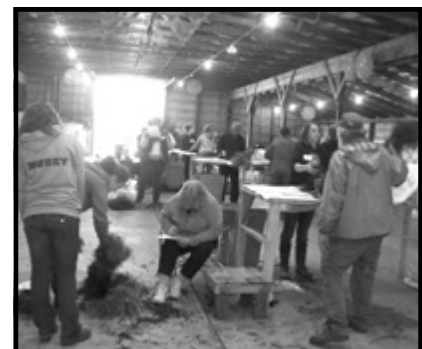
Photo: Volunteers, Board Members, NRCS Staff & SWCD Staff preparing tree orders for pick-up in April 2011