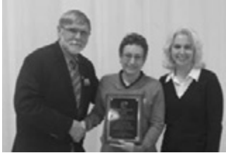
St. Joseph County Parks Dept. was named the 2013 Friend of Conservation