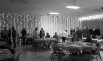
Guests socialize and browse the silent auction items prior to the meeting's call to order.