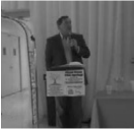
(Senator Donnelly spoke briefly praising the successes that the state of Indiana has had in cover crops - being that we are number one in cover crop use in the nation!)