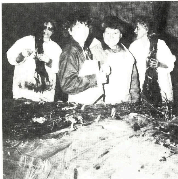
Pictured above are dedicated volunteers from Kosciusko and St. Joseph Counties, who helped package over 46,000 tree seedlings for the District's 1990-1991 Tree Sales Program.

The St. Joseph Soil & Water Conservation District will be sponsoring a Tillage Field Day in July. The date has not been set yet so keep your eyes open for upcoming information on. Conservation practices as well as the Farm Bill will be the topics