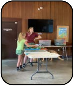
A camper is helping demonstrate how pollution affects a community using the EnviroScape model.

The SWCD helped the St. Joseph County Parks and the Kroc Center with their day camps in July and August.