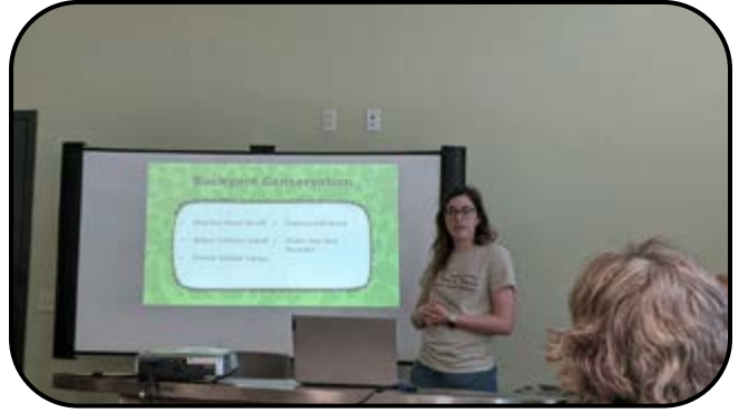
The SWCD had a great time partnering with Unity Gardens for the Urban Conservation Series in June.