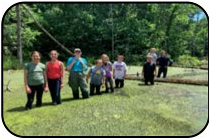
Our EEC and the campers survived the swamp stomp!

There are still spots available for scheduling programs!