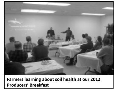
Farmers learning about soil health at our 2012 Producers' Breakfast