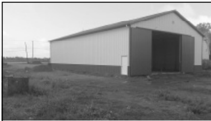
Completed Containment Area, with Building enclosure over it

One local project—a while in the making—was that of a Chemical Containment area. The facility allows for the storage of fertilizer and other agricultural chemicals in a designated area that will contain any of these chemicals if there happens to be a spill. Should a spill occur, nearby waterways will be protected from contamination via runoff, and ground water will be protected from chemicals leaching through the soil. While these facilities can be more expensive than other possible solutions, they are well worth it when you think of the dangers that come with having no protection.