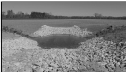
Completed Rock Chute Structures armor the ditch banks

NRCS was able to provide all of the engineer design for this project and some monetary assistance as well.