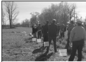
Farmers discuss cover crops and their connection to soil health at our April Field Day