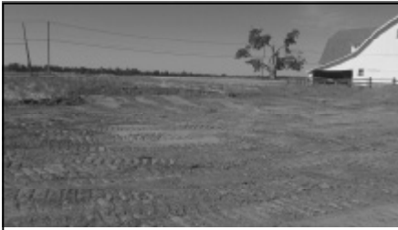
Project Site BEFORE Chemical Containment Area was installed