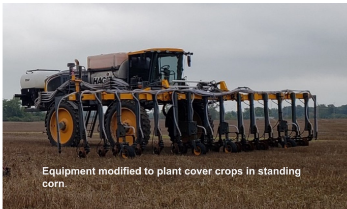
Equipment modified to plant cover crops in standing corn.

The 319 implementation grant for the Headwater Yellow River Watershed that the District received last year can help with as much as $15,000 of these costs. Even if the modification that you need is not listed, it is possible that you could still receive funds to help with changes. Not sure if you're in the watershed? Give us a call here at the office and we can help you find out. Incorporating important conservation practices on your acreage is crucial to keeping the soil healthy and the water clean, because nothing is more important!